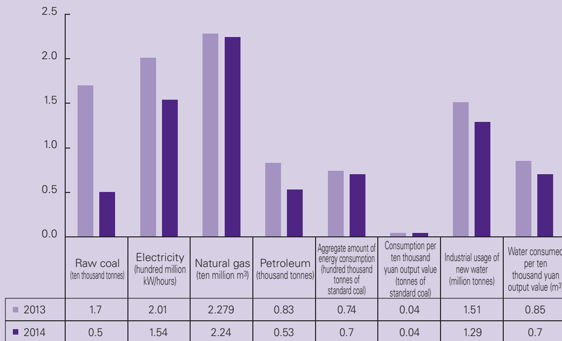
Chart 2 Energy Consumption of the Group

The Group continuously launched the promotion and education on energy saving and emission reduction. We procured our subsidiaries to launch a promotion campaign on energy saving, with the theme of “acting on the concept of energy saving and low carbon to build a sweet home”. The activity aims at enhancing all staff members’ awareness of energy saving, emission reduction and low carbon and striving to further reduce the aggregate consumption of energy and water per ten thousand yuan output value.